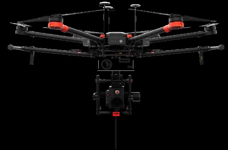
Underbelly Tether Support Dock Located At Center Of Gravity And Not At Rear Allows For Consistent Motor Temperature