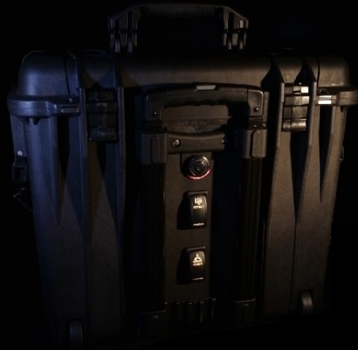
Top Loader Hard Case with Storm Protection. Quick Deploy with 208-265vac Input Available in 5 Colors